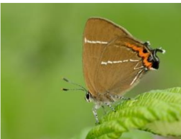
White-letter Hairstreak (underwing) Iain Leach

Our precious little Adémuz plants have come from Hampshire Butterfly Conservation who have been testing many varieties of elm on many different types of soil and conditions in the south of England in order to help preserve the White-letter Hairstreak butterfly. There they have grown well and seem to have good resistance to drought as well as flooding, so we hope that they will prove suitable for the Causeway, and – in 20 years or so – start to return a long-lost look of pre-1970s England.