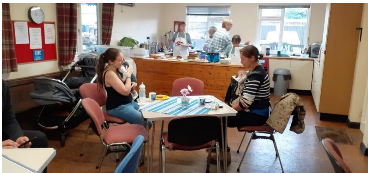
Young Mums enjoying the Warm Space cafe continued on p20

If anyone would like to come, but needs a lift, please do contact us and we will arrange this for you – simply email vol.steventon.rootsshoots@gmail.com